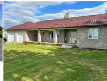
Front of Structure