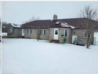
Back of Structure