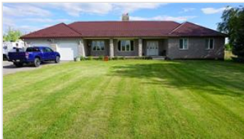
Front of Structure