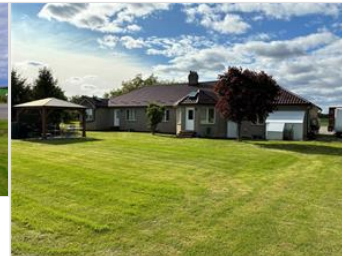
Front of Structure