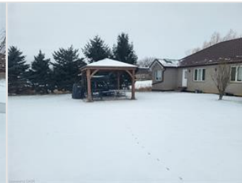
Back of Structure