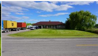
Front of Structure