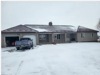
Front of Structure